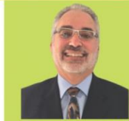
Craig Dome, PA